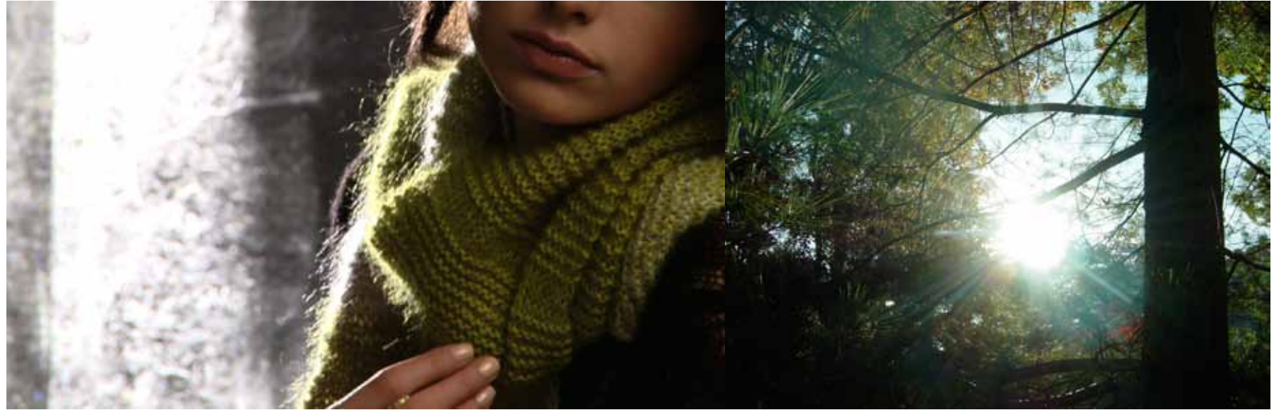
neutral.jade l.67in. w.9in. t.14in. cashmere. mohair. style 00038