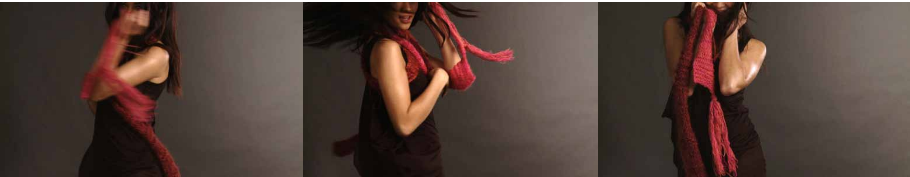
scarlet.magenta 1.89in. w.7in. t.11in. wool. mohair. style 00073