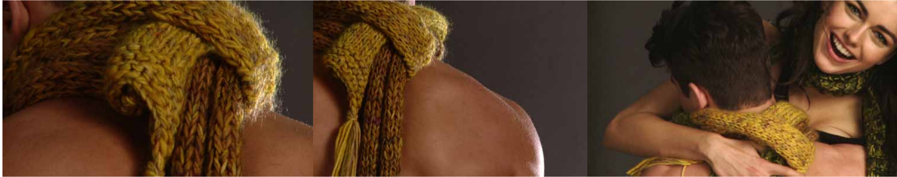
sun.tan l.74in. w.6in. t.11in. silk. wool. mohair. style 00039