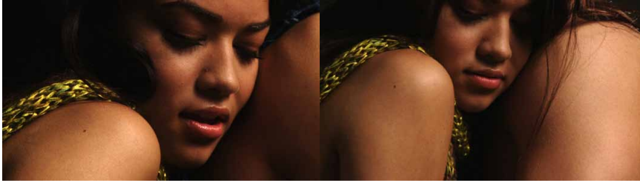
gold.bark l.84in. w.14in. t.11in. silk. cashmere. mohair. style 00044