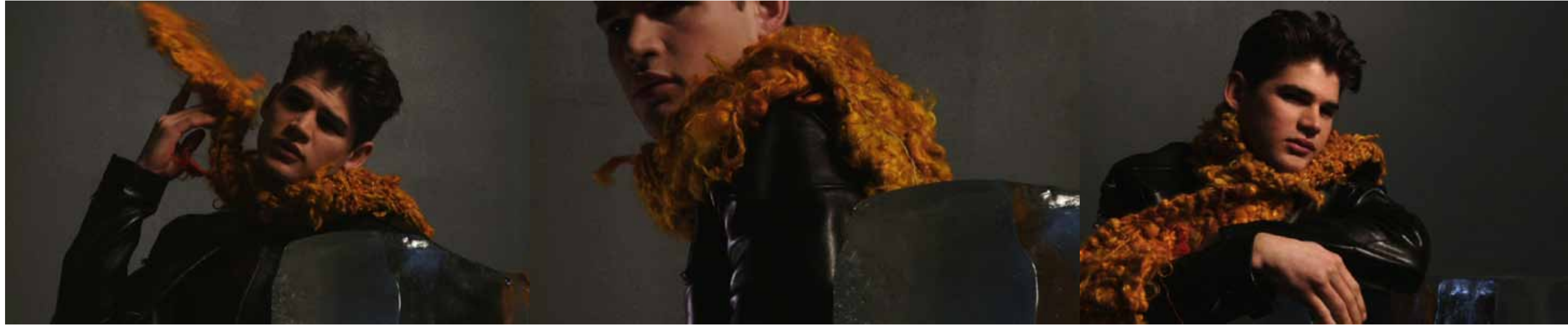
flame. l.67in. w.8in. t.13in. handspun wool. silk. mohair. style 00074