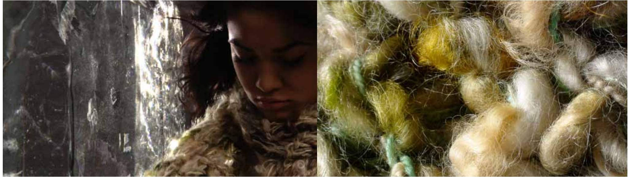
moss.ivory. l.66" w.13" t.16" handspun. wool. mohair. style 00035