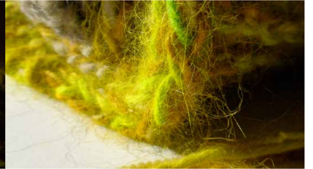
chartreuse. l.69in. w.6in. wool. cashmere. mohair. angora. style 00053