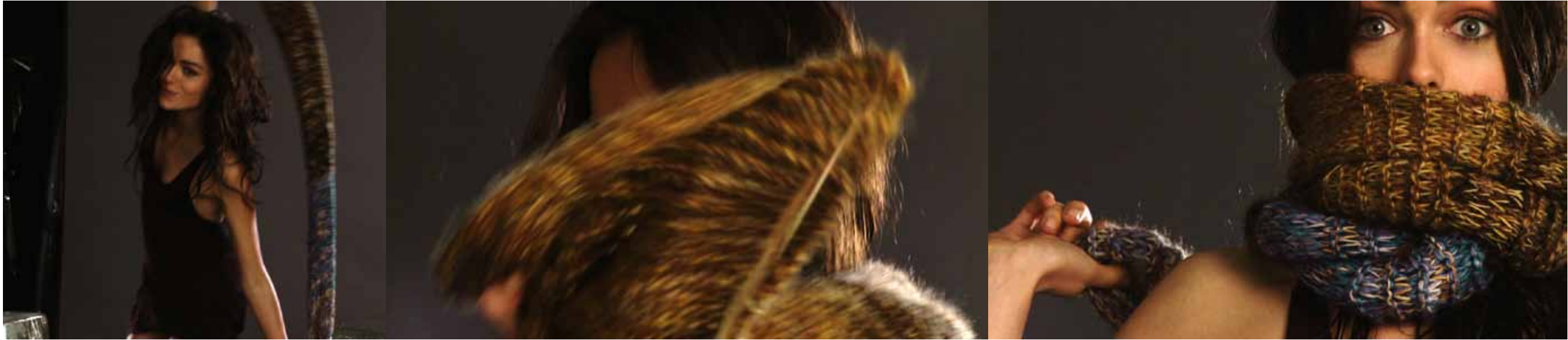
sky.wood. l.72in. w.14in. t.10in. wool. silk. mohair. style 00060