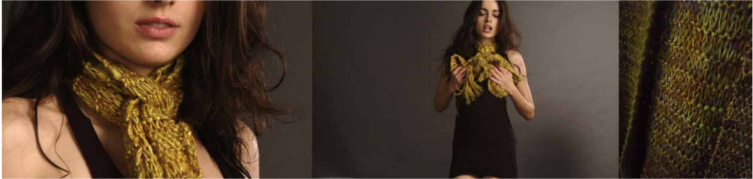
bright.gold l.74in. w.5in. t.10in. silk. wool. mohair. style 00040