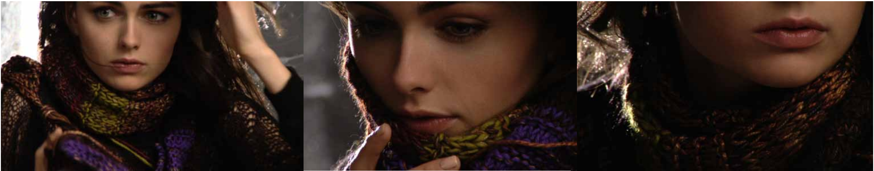
chestnut.multi. l.71in. w.6in. t.13in. wool. silk. mohair. style 00061