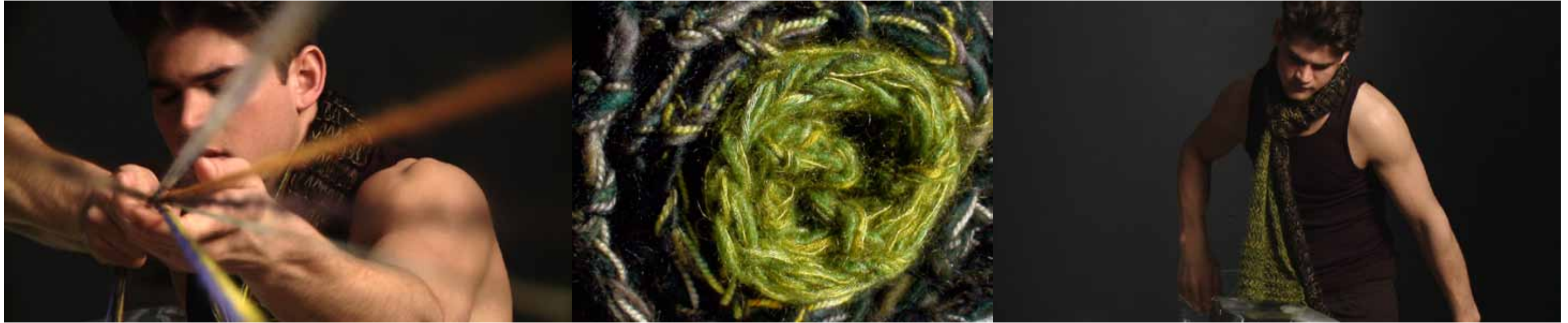
ebony.emerald l.75in. w.9in. t.13in. wool. cashmere. silk. mohair. style 00055