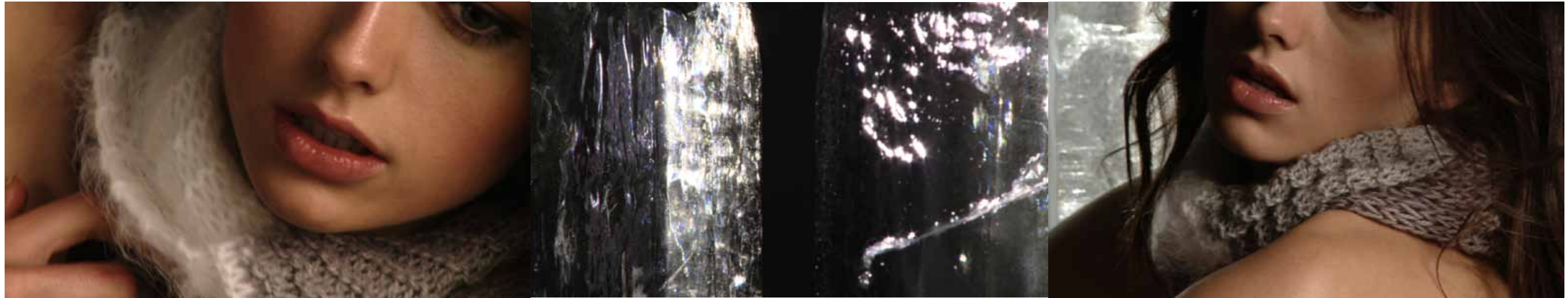
grey.white.black 1.56in. w.5in. t.14in. angora. cashmere. style 00028