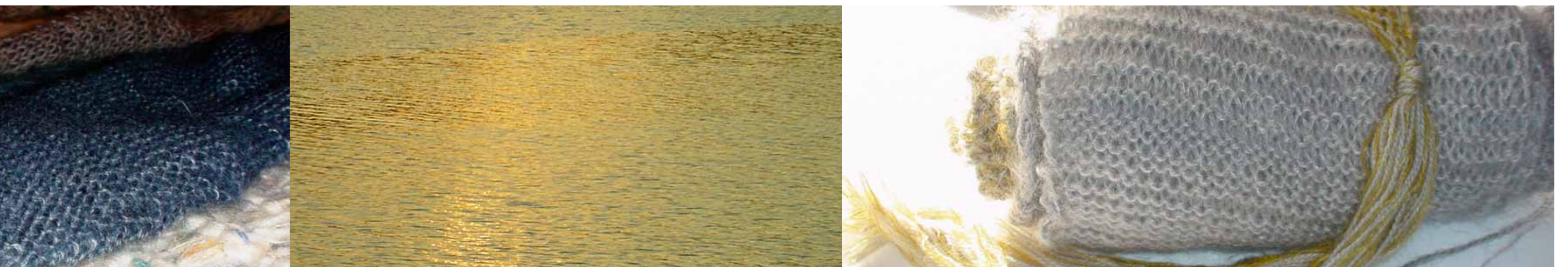
silver.gold. I.70" w.9" t.13" cashmere. mohair. style. 00030