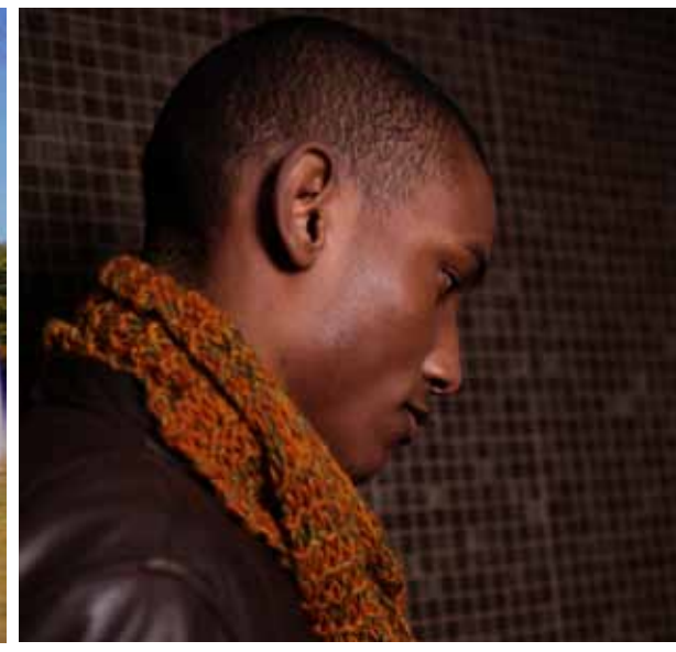
clay.green. I.77" w.5" t.12" wool. mohair. style 00071