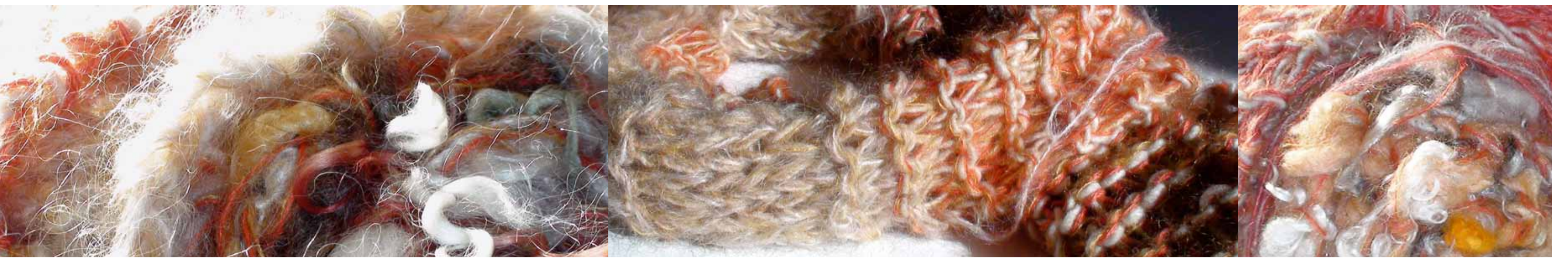
coral. I.96" w.8" t.10" handspun wool. mohair. style. 00072