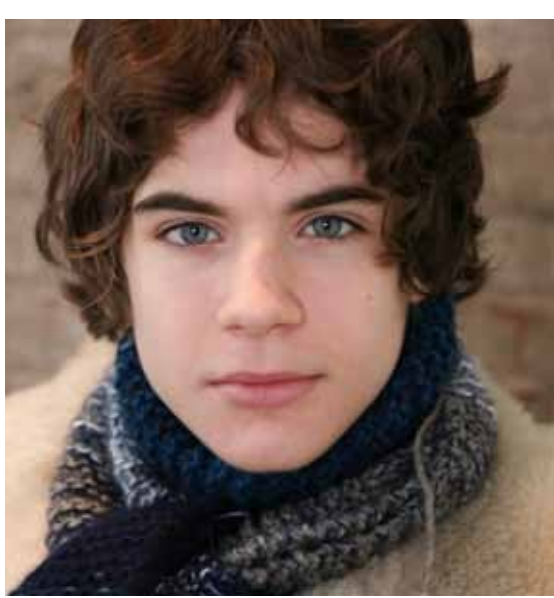
blue.frost. I.69" w.6" t.12" wool. mohair. style. 00065