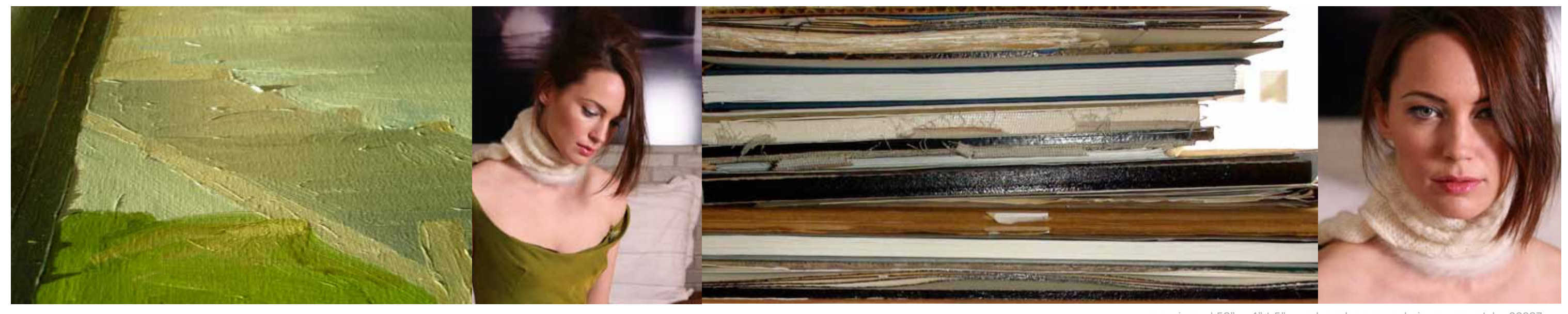
snow.ivory. I.58" w.4" t.5" wool. cashmere. mohair. angora. style. 00027