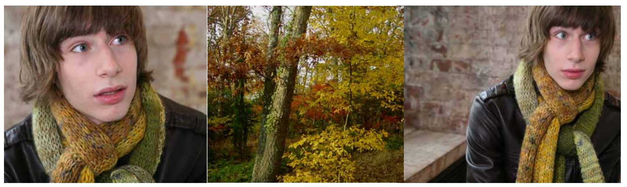
sun.tan. l.74" w.6" t.11" wool. mohair. style. 00039 moss.umber. l.75" w.5" t.11" wool. mohair. style. 00046