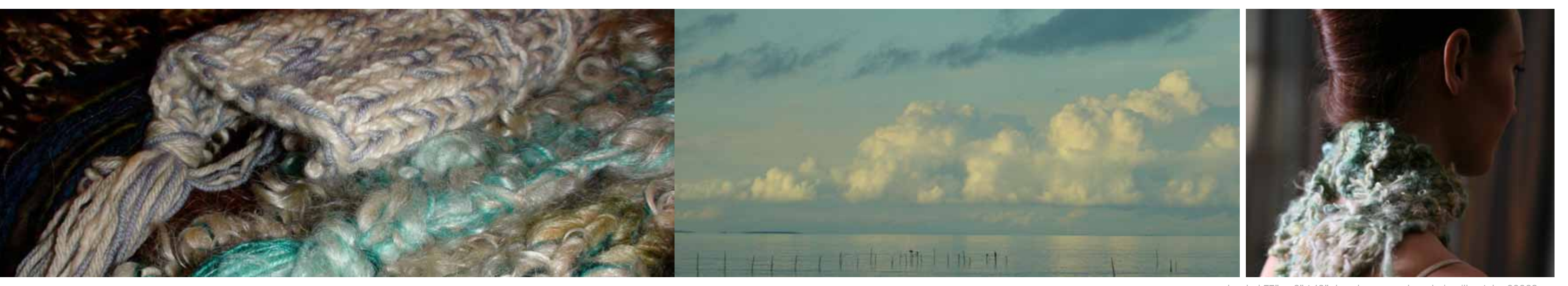
cloud. I.77" w.6" t.13" handspun wool. mohair. silk. style. 00068