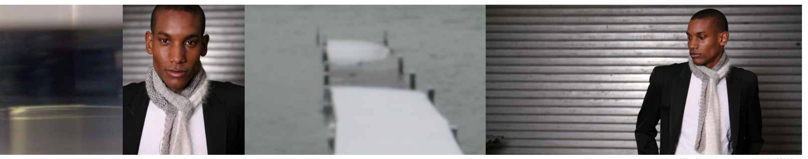
grey.white. I.67" w.7" cashmere. angora. style. 00029