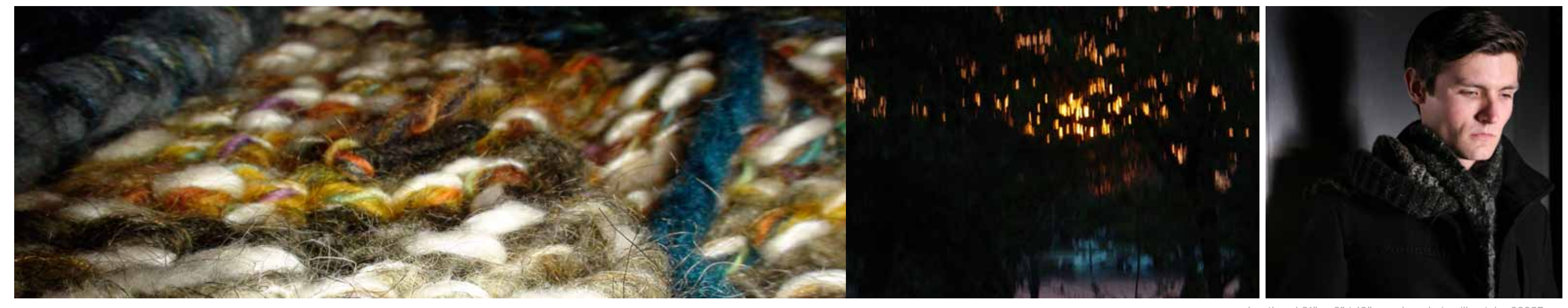
grey.heather. I.91" w.6" t.13" wool. mohair. silk. style. 00057