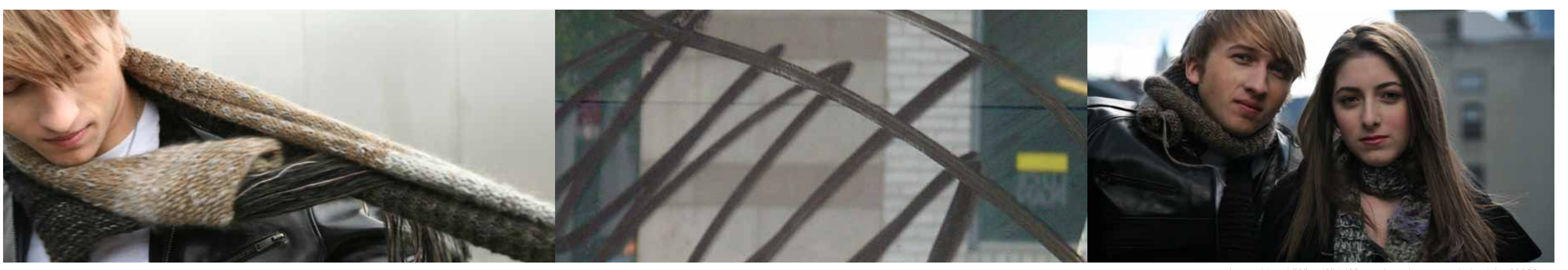
charcoal.tan. l.72" w.10" t.13" wool. cashmere. mohair. style. 00058 ebony.thistle. l.79" w.6" t.12" handspun wool. cashmere. mohair. silk. style. 00037